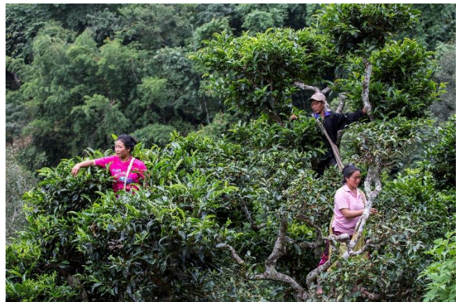
Tea growers in Laos.

Rural MEs will be supported toward commercial viability through the transfer of financial literacy and entrepreneurship skills, access to technologies, credit, and services, and economies of scale. The project will promote access to finance and dialogue in public fora on enabling environment issues that constrain ME growth. The project will leverage existing systems and resources, including partnering with GOL at the provincial and district levels to build their capacity to deliver enterprise training.